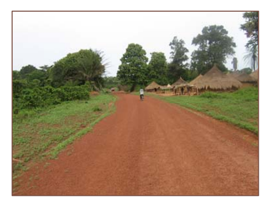
A newly rehabilitated gravel road in CAR

the isolation of the country's hinterland, in place of the small boats that exist today. This would help improve river safety.