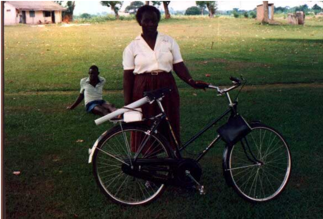
A Phoenix ladies bicycle belonging to a family planning field worker in Tororo