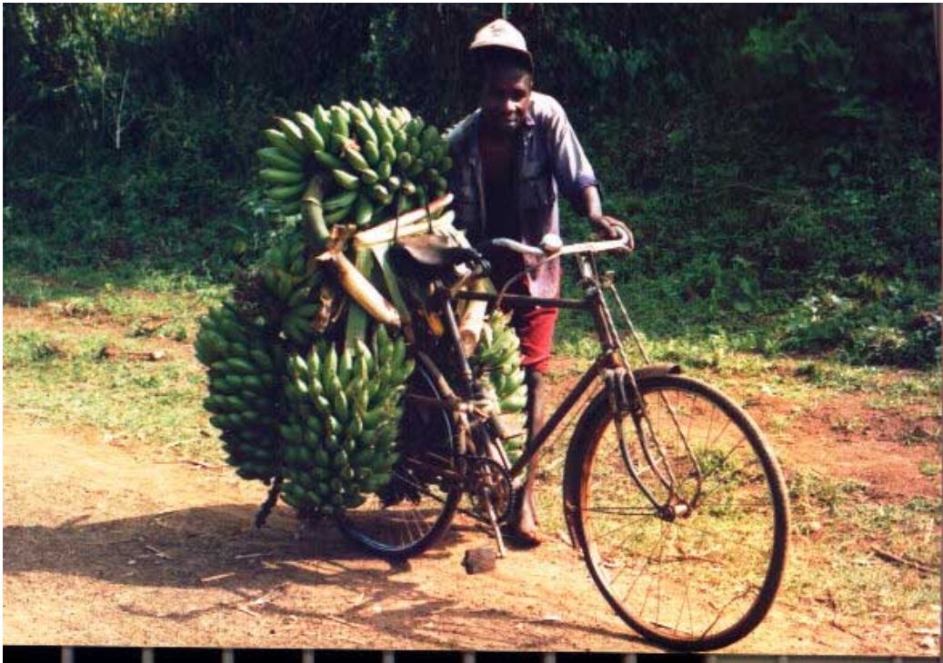
A typical rural trader carrying matoke