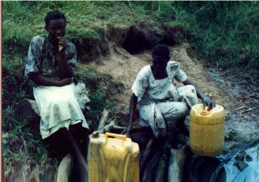
Women fetching water in Mulenju village in Tororo district