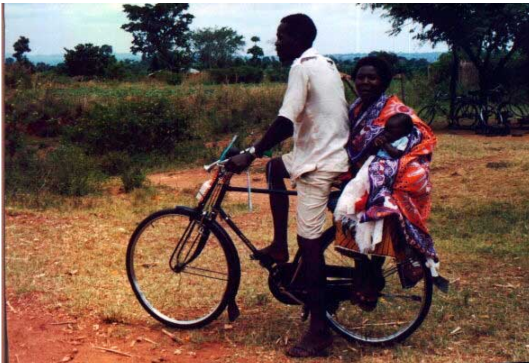
Boda-Boda transport services are extensively used by urban women