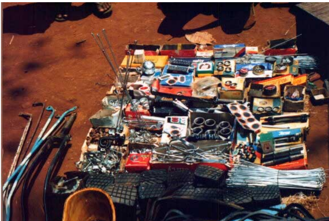
A display of available bicycle spare parts at the repair facility above