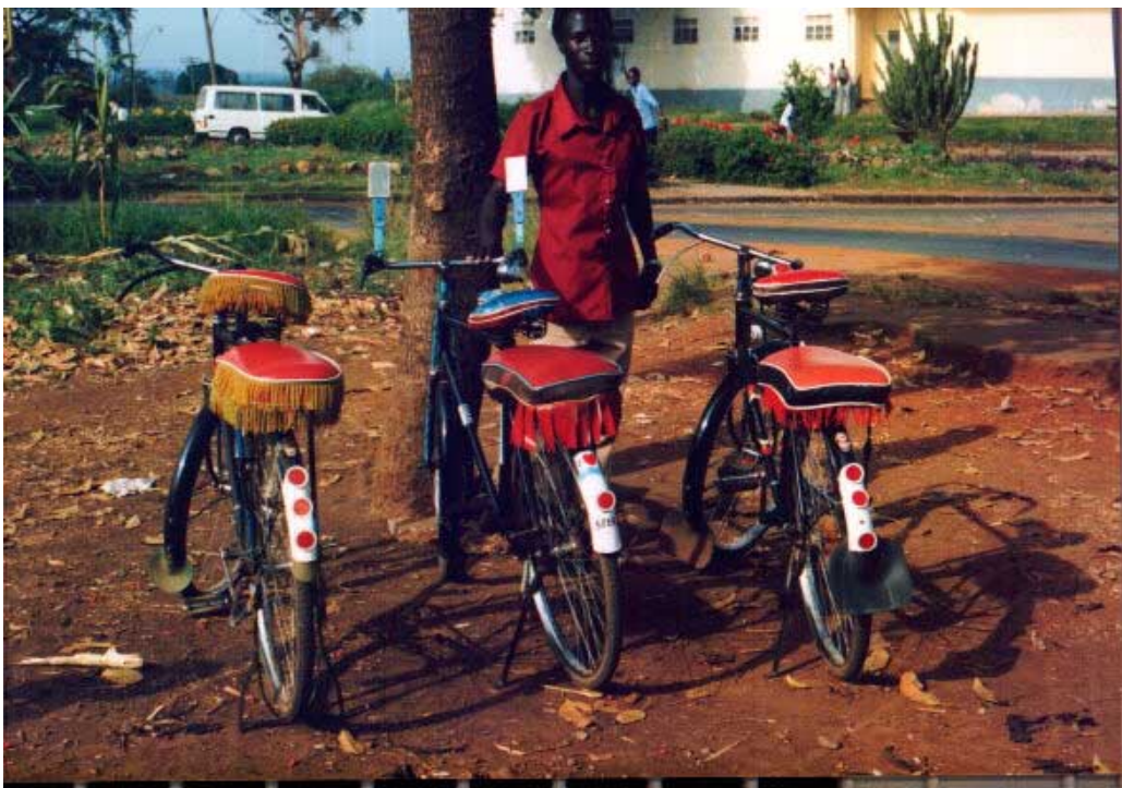
Boda-boda bicycles showing the padded cushion fitted over the rear rack