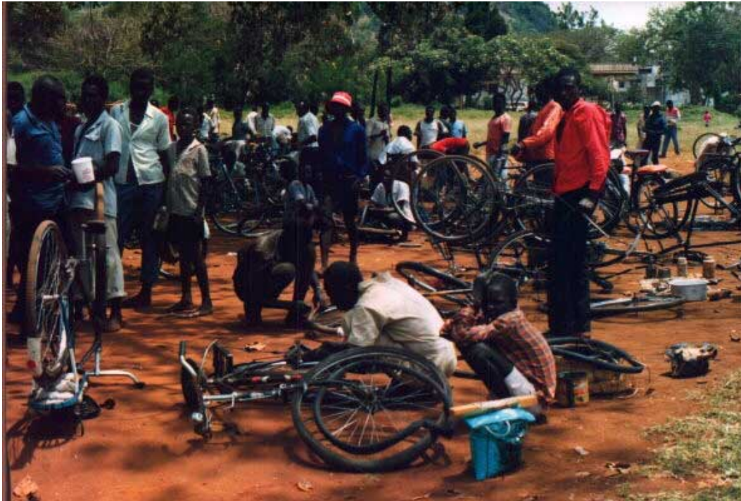
This informal roadside bicycle repair facility outside Tororo town is bustling with activity