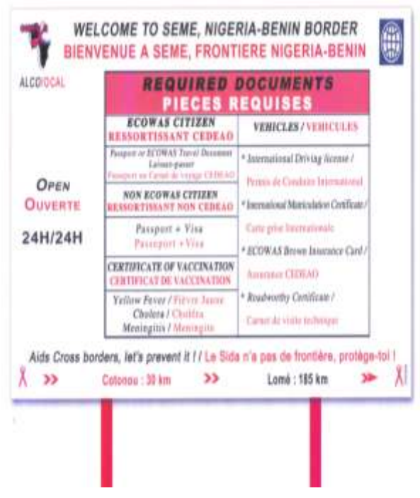
The project posted Information on documents required at border crossings to help speed the process

the national average. Changing HIV-related behavior and monitoring progress in mobile populations is more difficult than in settled populations. It required special strategies and approaches such as creating community-based Border HIV/AIDS Committees and Inter-Country Facilitation Committees. M&E in particular requires long-term investment and vision. The project built solid links with country M&E systems to minimize risk of duplication, and fed data into national systems. Stakeholders in the target areas validated findings.