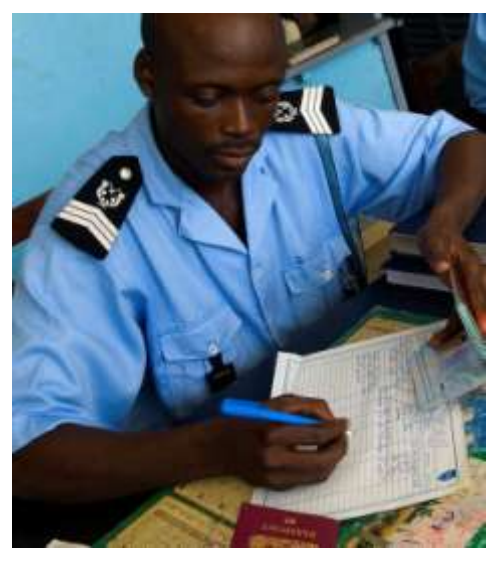
Good project collaboration with uniformed personnel

The World Bank Africa Region Transport Sector (AFTTR) demonstrated exemplary dedication and co-ownership of the project. The project greatly benefited from significant technical and financial support of UNAIDS, ACT Africa (AFTHV), HDNGA and AFTTR.