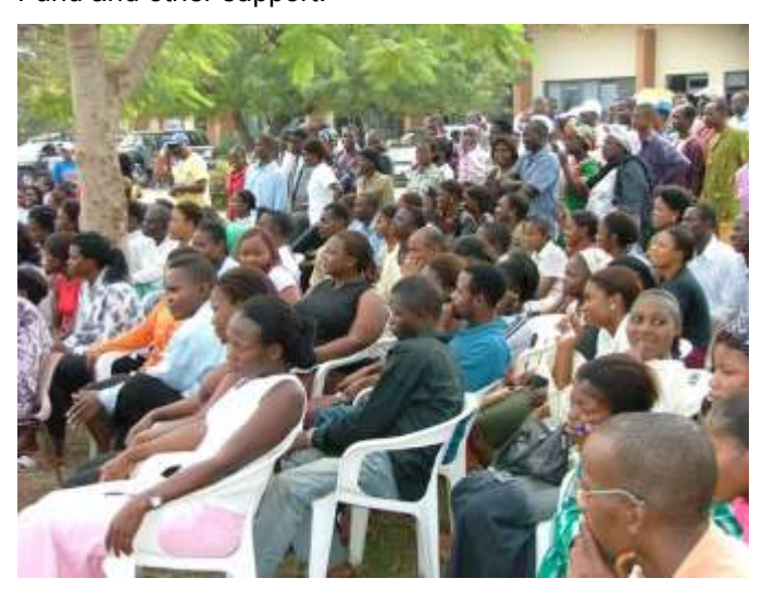
A Love Life Caravan stop in Badagri attracts a huge crowd (2006)

The Love Life Caravan has become a recognized brand. Information kiosks at project sites sport the Caravan logo, and the Caravan continues annually with Global Fund and other support.