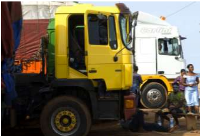
Hillacondji border – some of the target beneficiaries of the project’s services and information

Health center training focused on integrated care -- prevention interventions, VCT, follow-up, ART, PMTCT in some centers, laboratory services, treatment of STIs and opportunistic infections, and medical waste management. Health center staff received training to improve the quality of service provision. In addition to the basics, training paid particular attention to making sex workers feel welcome at the centers so that they would not avoid seeking treatment. To ensure continuity of care for mobile people, the project adopted a single medical file for following up drivers and other patients who accessed services in more than one center. Mobile clients carried their medical record with them as they traveled. The project gave funds and capacity building support to associations of PLHIV to provide community-based care.