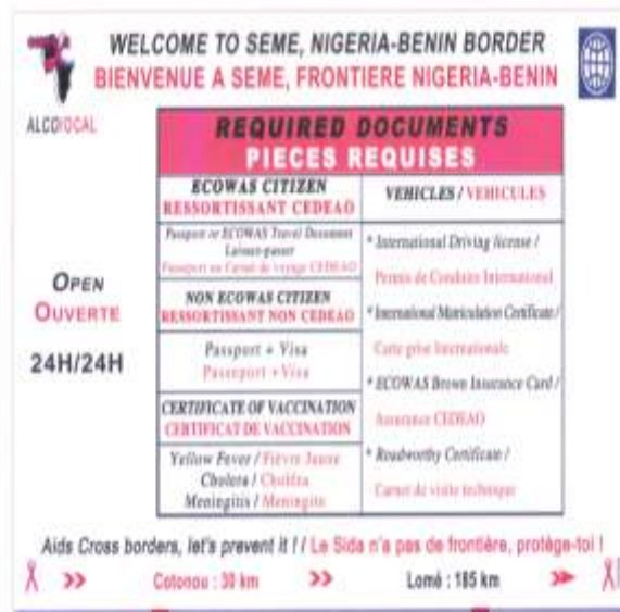
The project posted information on documents required at border crossings to help speed the process

the national average. Changing HIV-related behavior and monitoring progress in mobile populations is more difficult than in settled populations. It required special strategies and approaches such as creating community-based Border HIV/AIDS Committees and Inter-Country Facilitation Committees. M&E in particular requires long-term investment and vision. The project built solid links with country M&E systems to minimize risk of duplication, and fed data into national systems. Stakeholders in the target areas validated findings.