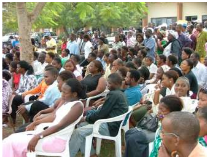
A Love Life Caravan stop in Badagri attracts a huge crowd (2006)

The Love Life Caravan has become a recognized brand. Information kiosks at project sites sport the Caravan logo, and the Caravan continues annually with Global Fund and other support.