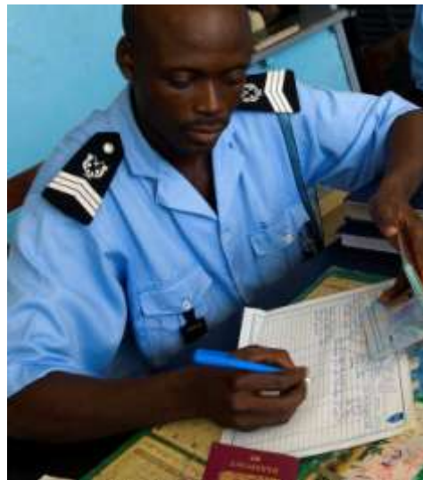
Good project collaboration with uniformed personnel